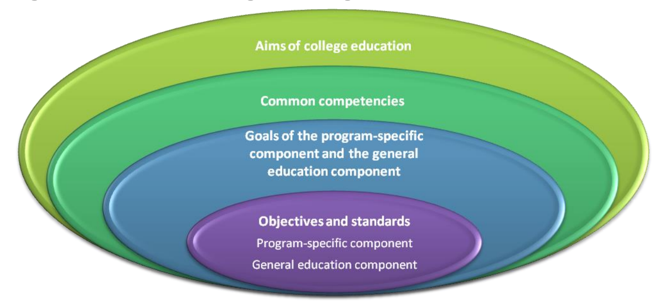
Figure 1 – Elements of a College-Level Program

Programs leading to the Diploma of College Studies (DCS) include two main components: a general education component and a program-specific component. Both these components contribute to a student's education, as the knowledge, skills and attitudes imparted in one are emphasized and applied in the other, whenever possible. General education is an integral part of each program and, when coupled with the program-specific component as part of an integrated approach, fosters the development of the competencies required by all programs.